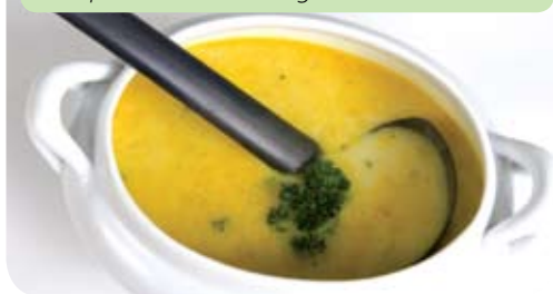
Potato and curry soup

Add extra vegetables such as cauliflower, beans, peas, silverbeet or spinach to make it go further.