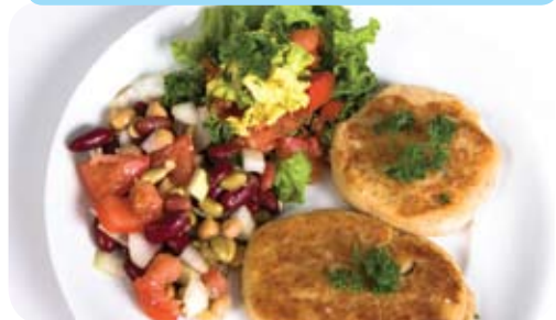
Mixed bean salad with fish patties

Try adding chopped orange segments and celery.