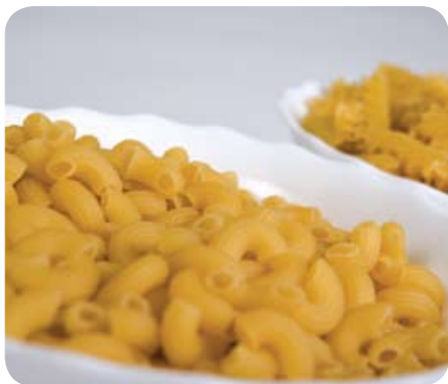
Dried pasta shells

Add chopped tomato and chopped cucumber or tinned fish and lemon juice with chopped spring onion or try chickpeas, raisins, cinnamon and mixed spice.