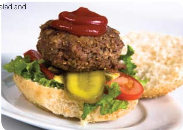
Hamburger and salad

If you have leftover mince use it to make meat balls or extra patties and freeze for another day.