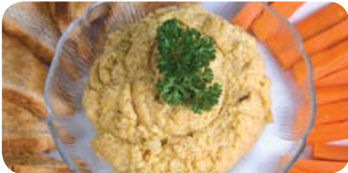
Hummus with carrot sticks and bread