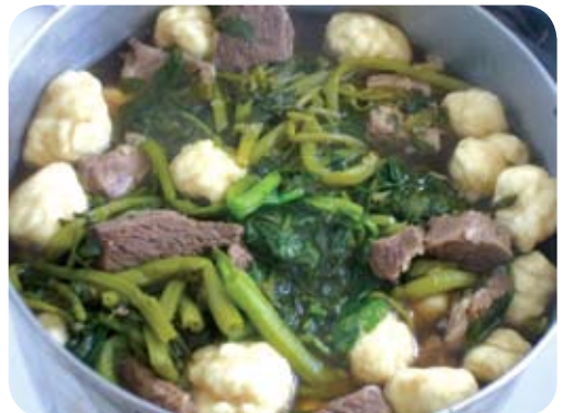
Richard's boil up