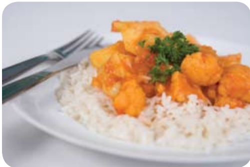
Potato and vegetable curry

Spinach, silverbeet or cauliflower taste good in this curry. Just add them to the pot 10 minutes before it is ready.